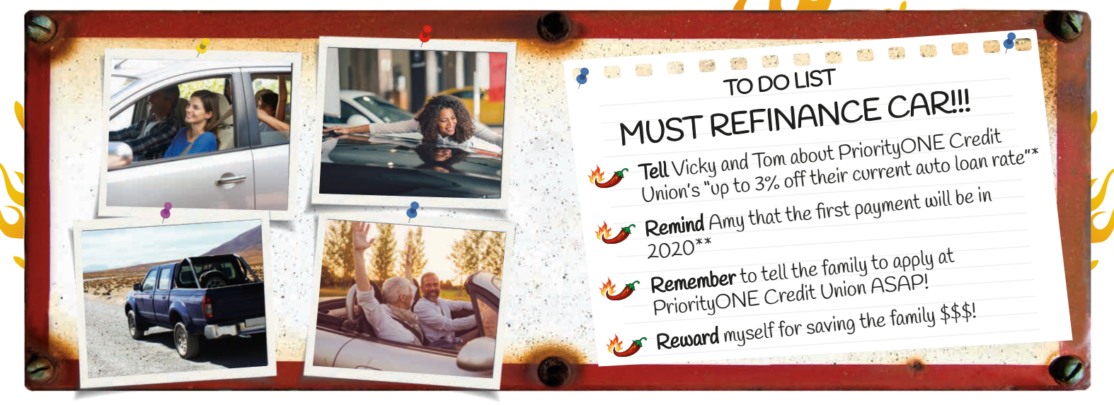
*Subject to credit union guidelines. This promo is for vehicles currently financed at other financial institutions. Floor rate is 2.49% Annual Percentage Rate. **Interest will accrue during the first 90 days.